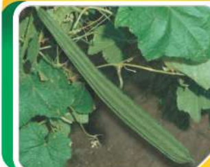
MAHY SUREKHA (1)