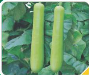
MAHY WARAD (4)